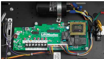
Includes the Medium-Duty Logic Board with Built-In Receiver